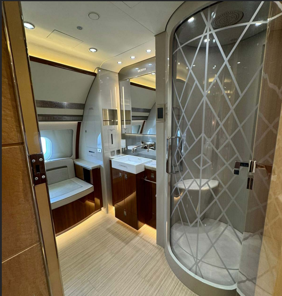
VIP MASTER BATHROOM